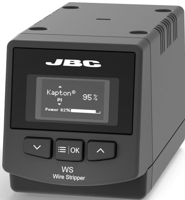
WS High-Temperature Wire Stripper Control Unit