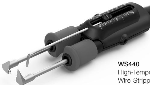
WS440 High-Temperature Wire Stripper Tweezers